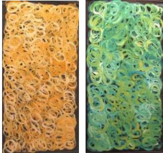
Size: 120x60cm $4000 each

and one still ought not to under-estimate the ongoing popularity of Minnie Pwerle's work. We have some great panel size Minnie's on hand, and I'm hoping to bring back more. They are a great size at 120x40cms, and priced very well.