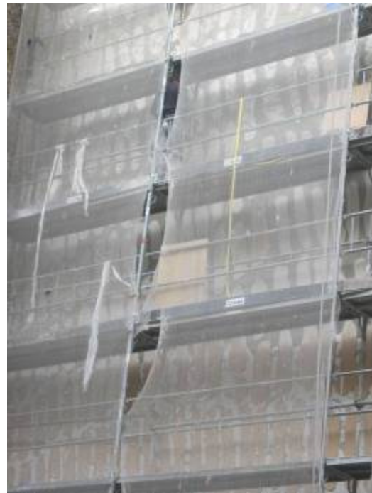
The etching on the outside wall which be a Lena Nyabi painting set in relief on the façade of the building. All large scale paintings, etchings and reliefs are all being recreated by well known French artisans, who have worked very closer with the project team and the artists.

concrete (pun intended), the significance and importance of the Australian Aboriginal culture, not just to this country, but to the world.