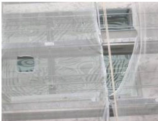
The ceiling of one section of the building showing a large scale painting by central desert artist Ningura Napurrula. The building is still being built hence the plastic sheeting. The photograph is taken from ground level looking up at the third floor.

Arthur and I took a much needed holiday to Europe in October and while there took the time to visit the Musee du Quai Branley in Paris, right next to the Eiffel Tower. The museum is entirely dedicated to the world's indigenous art and artists and is due to open in June next year.