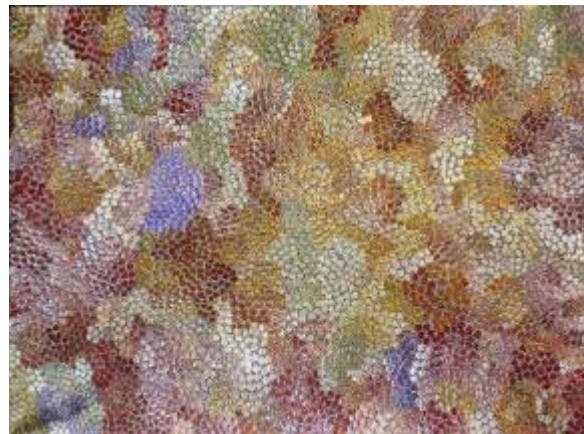
Bush Tomato 120x90cm