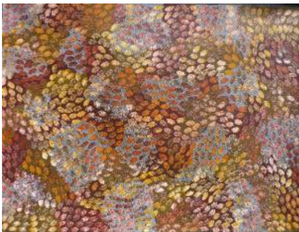
Spinifex Story 120x90cm

Selina is currently preparing for a group show in the USA