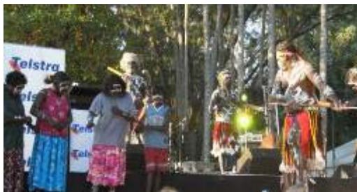
Opening night 2007 Telstra Indigenous & Torres Strait Islander Art Awards, Aug 10 in Darwin

On another tour option, while recently in Darwin for the 2007 Indigenous Art Awards, I had a meeting with a new tour operator company who take tailor made art tours through Arnhem Land and surrounding regions. These range from 1 day to 11 day tours. They are high end tours, with luxury accommodation. If you would like further information or details, please email info@artitja.com.au or call 08 9336 7787.