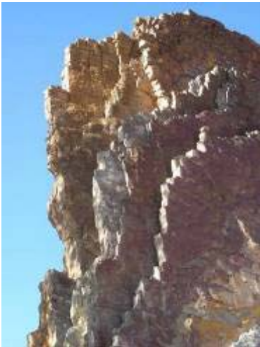
Ochre Pits, West MacDonald Ranges – just one of the scenery wonders out bush.

Thank you to those of you who responded indicating interest in coming on a desert tour. We are still considering the options and will let you know as soon as we have anything in place. It is a resourcing issue more than anything else at this stage, but something we would love to do with you. It will most likely not be until 2009 as it is of course seasonal.