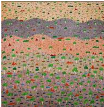
Lulu Teece Apetyarr Landscape (below) Selina Teece Pwerl Bush Tomato (r)