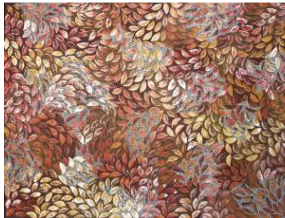
Selina Teece Pwerl Spinifex Story

use of background dotting creates a 3D effect - many of you have seen iconography in her Spinifex Story paintings such as lips, kisses and lemon slices. While these paintings depict the spinifex bush in her country, her bush tomato series are much more akin to the fine dot work characteristic of the Utopian artists. Here's a preview: