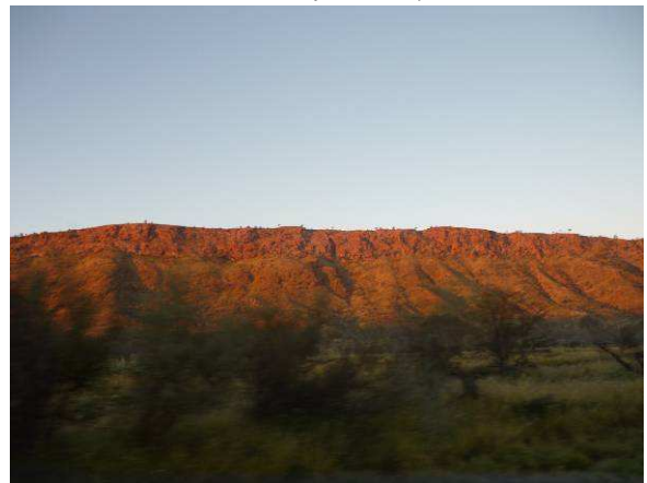
Those McDonnell Ranges grab your heart each time (below) the rain just kept coming back