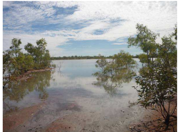
In ten years to Utopia this is the first time I have seen this 'field' full of water. The wildlife was plentiful.