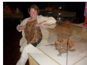
(L) Opening of Menagerie at the WA Museum in Oct (r) Filled Neck Lizard in Menagerie exhibition