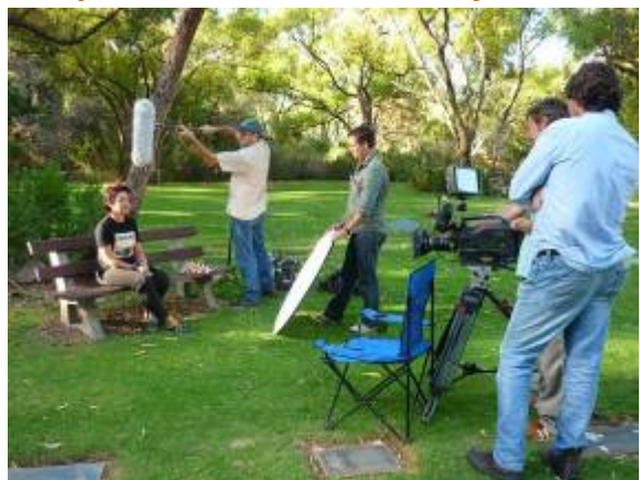
Filming of Prospero Production's Heartbreak Science docu