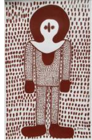
L: Black Wandjina (bringer of the storms) $800 R: Jugulimurra Wandjina (collector of shells) $1280