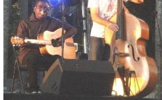
Photograph : Anna Kanaris