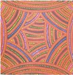
Cindy Wallace 30x30cm $90