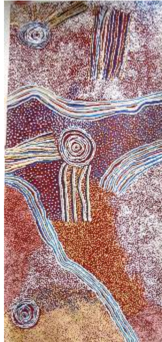
Bill Whiskey 215x98cm POA

(Biographical information courtesy Watiyawanu Artists Corp)