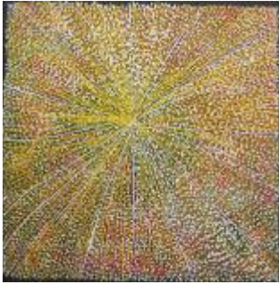
Audrey Morton 30x30cm $110

We have some lovely small works available – great gifts either for Christmas or if visiting friends or relatives overseas. Here is a small selection: