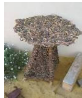
Flower Stand $600