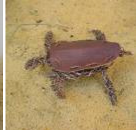
Small Turtle $90