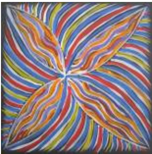
Helen Kunoth 30x30cm $90

You can also check out our website www.artitja.com.au for more.