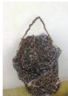
Fish Trap (SOLD)