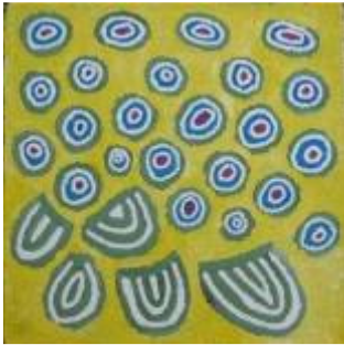
Narbulla Scobie 40x40cm $200