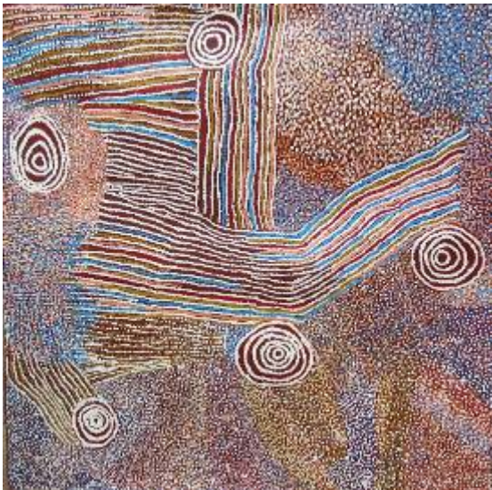
Bill Whiskey 150x150cm POA

We currently have these two Whiskey paintings available: