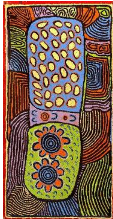
Maisie Campbell Napaltjarri 150x78cm