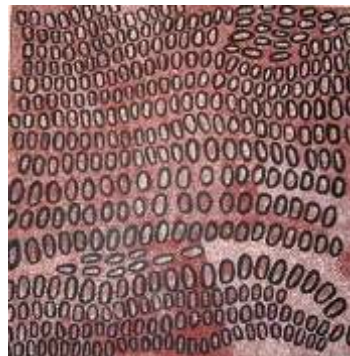
Ngoia Pollard Napaltjarri 90x90cm (Artitja stock)