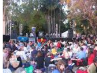
The crowd at the NT Museum and Art Gallery in waiting for the 23rd Telstra NATSI Awards to begin.