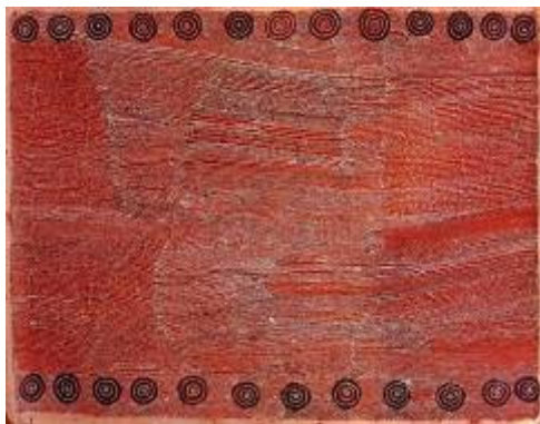
Wentja 2 Napaltjarri 120x90cm