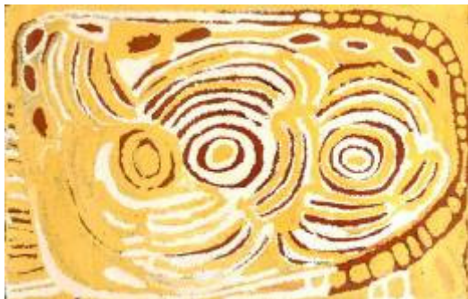
Tjukiya Napaltjarri 70x46cm