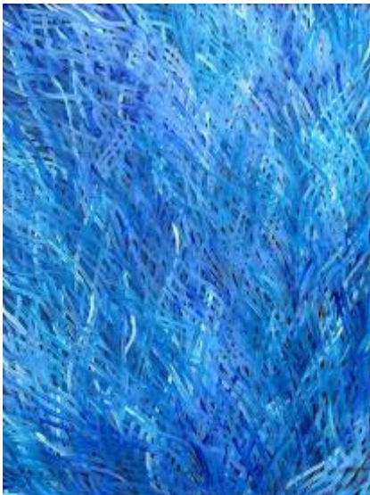
Barbara Weir 120x90cm (top) 120x120 (below)