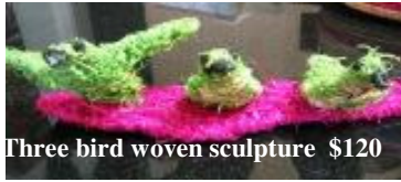
Three bird woven sculpture $120