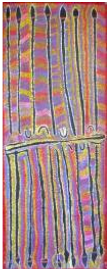
Peggy Poulson 122x46cm . $990